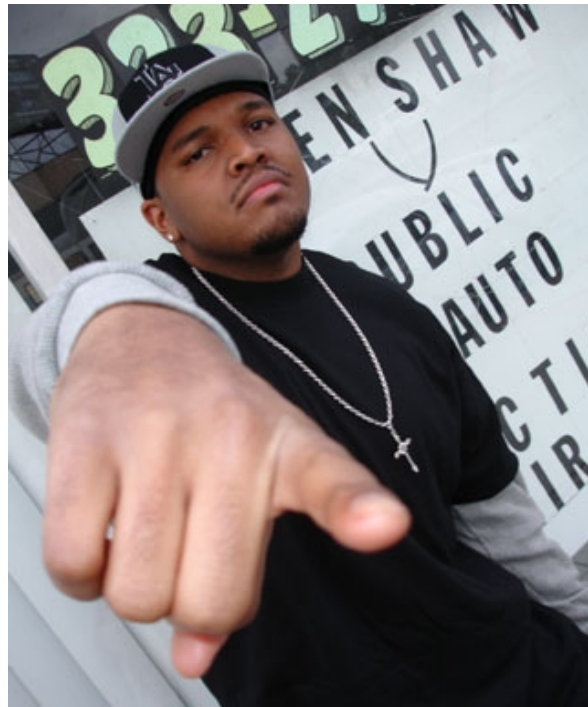
THE POSE AND THE ATTITUDE OF HIP HOP. MISSING: THE BLING AND THE HOODIE

Rhythm and Blues – R&B originally referred simply to music from the Black community. Soul, Funk and Mo-town were popular sub-genres. Currently, the most popular sub-genre is Rap. Within Rap, Hip Hop tops the charts. The Gangsta Rap of the 1990s (Ice-T, Tupac, LL Cool J, Eminem) was openly violent and anti-establishment. Today's Hip Hop artists (Jay Z, Lil Wayne) focus their lyrics on money, sex, power and fame. Songs by the artists T-Pain and Ne-Yo are the most popular selections for club deejays.