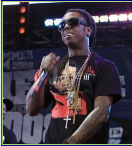
This photo from a live concert has been cropped due to obscenity.