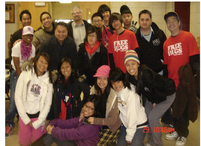
"Yeah, right... as if THAT's gonna happen!"

Just before the Y.E.S. retreat, a very generous donor gave us $5,000. That subsidized part of the cost of the retreat. Sixteen of us went (twelve kids and four staff) and we saw the power of the Holy Spirit that week-end. The kids caught fire. They started worshipping, clapping, singing and raising their hands. A strong bond was built among them and with the other youth at the retreat. They were encouraged to see so many other kids who were