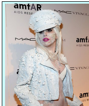
The rest of Lady Gaga's outfit, not pictured, is a bikini bottom

has the number one and number eight hits on Billboard's Top 200. He is the youngest male to top the charts since Stevie Wonder in 1963. He is being raised by his 34-year-old mother, a professed Christian.